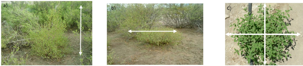
Figure 2. Measurement of a) height ( TH ), b) larger diameter ( LD ) and (c) smaller diameter ( SD ) of Lippia graveolens Kunth shrub.