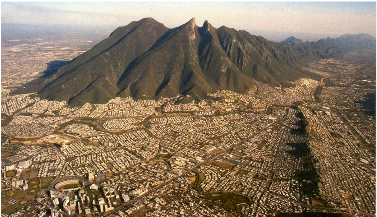
Figure 1. Panoramic view of Cerro de la Silla Natural Monument in Monterrey city, Mexico.

The MNCS is part of a mountain range that extends southeast from the metropolitan area of Monterrey along 42 km in an altitudinal range of 500 to 1 782 m. Together with the Sierra Cerro de la Silla state protected area, it constitutes a continuous corridor of natural vegetation that amounts to 16 639 ha (Cantú et al. , 2010); both areas represent an important source of environmental services that supply water to the Metropolitan Area of Monterrey (AMM), mainly (DOF, 2014) (Figure 1).